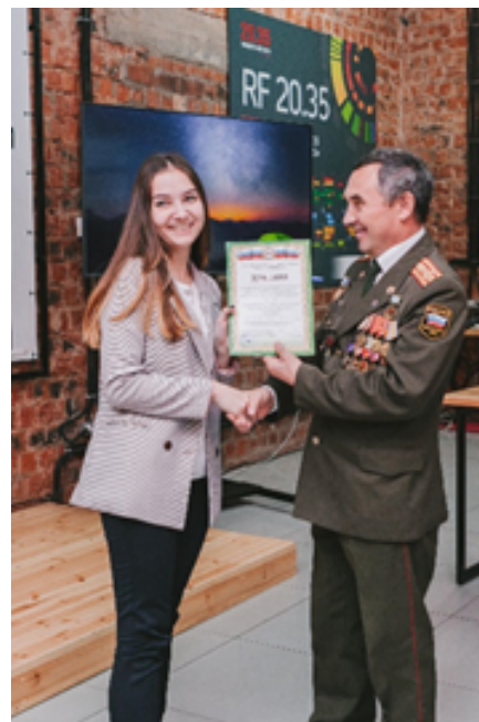
Constitutionalism and Power in Russia: History, Contemporary Problems and Prospects Conference

The aim of the program is to improve legal literacy, systematize knowledge on legal regulation in the field of combating corruption and the formation of an anti-corruption worldview.